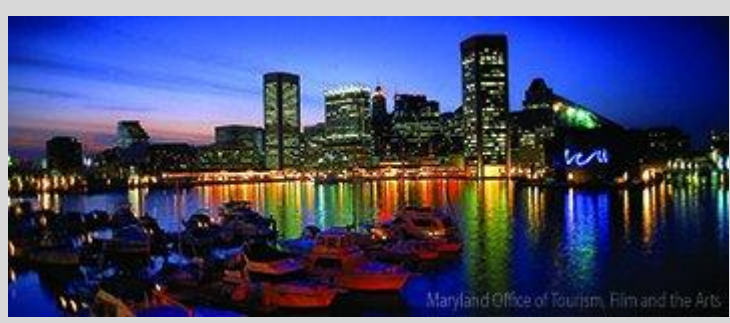
Make plans now to attend the 2015 DKG Northeast Regional Conference

The Delta Kappa Society International, P.O. Box 1589, Austin, Texas 78767