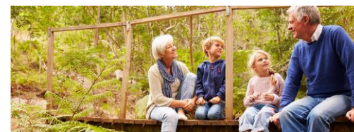
Making a Decision on Membership

Unfortunately, DKG's Constitution is very clear about what situations qualify for reserve membership and this does not. (Must be physically disabled or geographically unable to participate.)