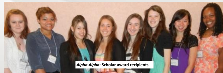
Alpha Alpha: Scholar award recipients