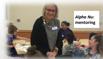
Alpha Nu: mentoring