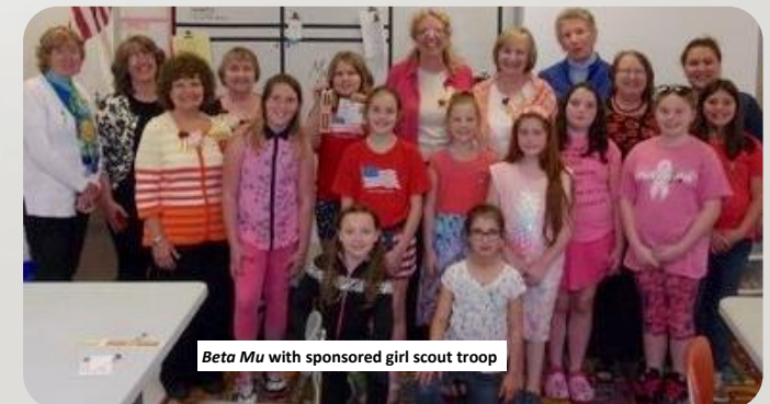
Beta Mu with sponsored girl scout troop