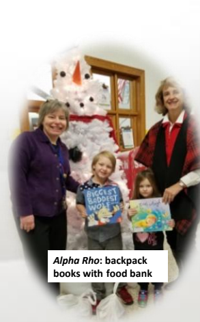
Alpha Rho: backpack books with food bank