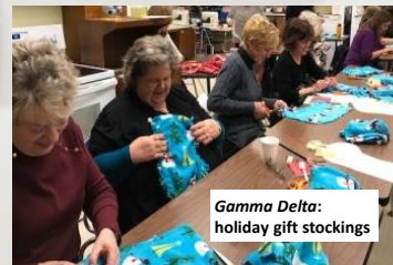
Gamma Delta: holiday gift stockings