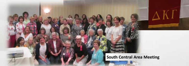
South Central Area Meeting