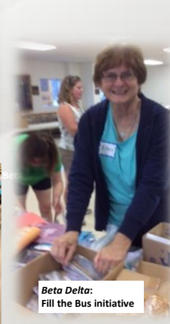
Beta Delta: Fill the Bus initiative