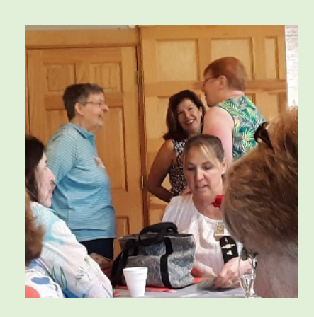
Article and photos by Amy Zimmerman