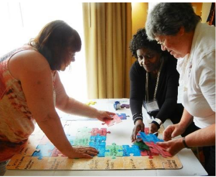
Putting the Pi State puzzle together