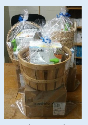
Welcome Back Breast Pump Kits