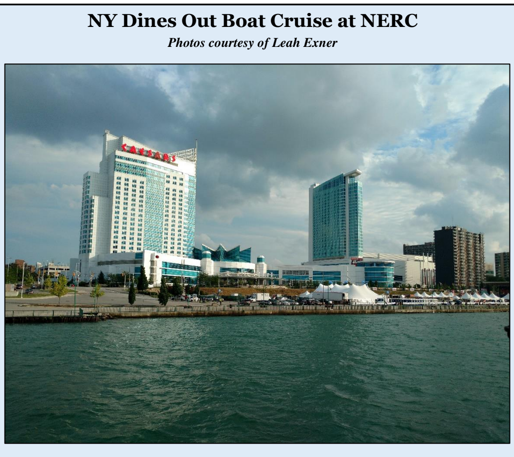
Skyline of Caesar's Resort, Windsor, Ontario