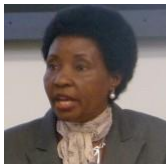
UN Deputy Secretary General Dr. Asha-Rose Migiro