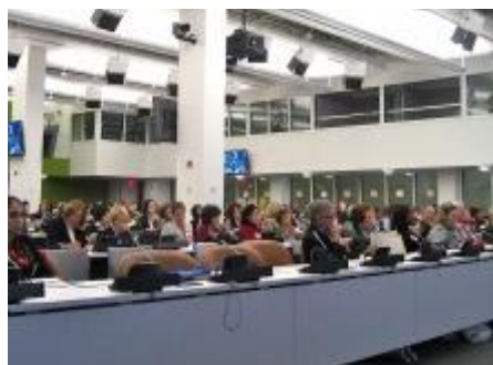
Conference participants learned that www means..... world without war .

For 13 th Annual CTAUN Conference Summary and Guest Speakers, other CTAUN Events in the United States, Conference Archives, Best Practices Awards, Teacher Resources and more, refer to website: www.ctaun.org .