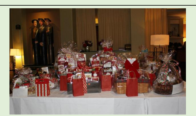
An amazing auction spread at the Alpha Beta Holiday Gala