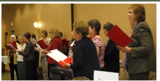
Pi State Chorus Remembrance