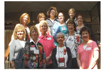
Presidents and Officers from NC, SC and N Areas of Pi State