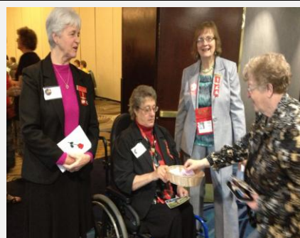
Awards Brunch Hostesses