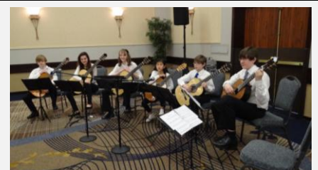
The Castellani-Andriaccio Guitar Studios at the President's Banquet (Students have been studying the Suzuki Guitar Method from as young as four.)