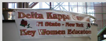
DKG banner welcomes sisters in the lobby of The Hyatt Regency Buffalo