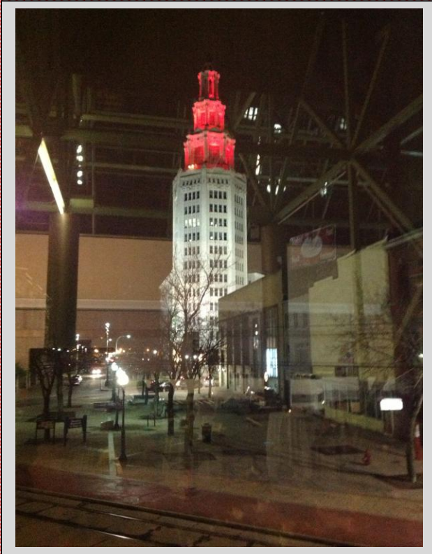
The Electric Tower's spire, as seen from the second floor of Hyatt Regency Buffalo, was glowing in red to honor Pi State 2013 Convention, April 19 and 20.

- Phyllis Hickey, 2013 Pi State Convention