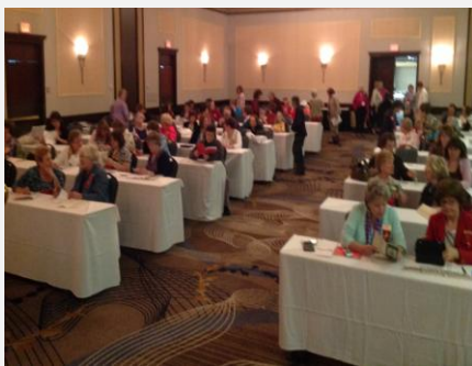
Pi State Executive Board Meeting