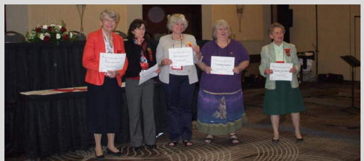
Capital Area Women of Distinction Awards