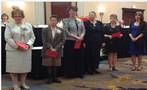
New Officer Installation at the President's Banquet