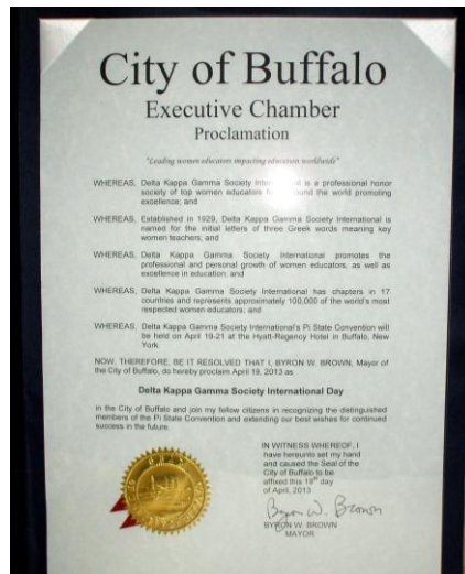
Buffalo's Mayor Byron W. Brown's Proclamation to honor Pi State 2013 Convention