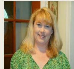
Stacy Liberati