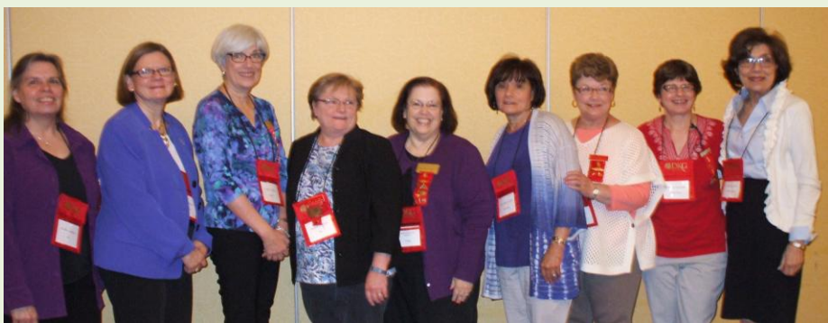
Accepting Chapter Birthday Recognitions (l to r):