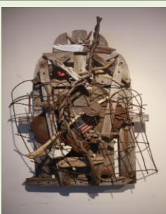
Seen to Be Patriotic Sculpture