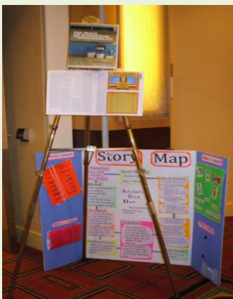
Convention Workshop Display