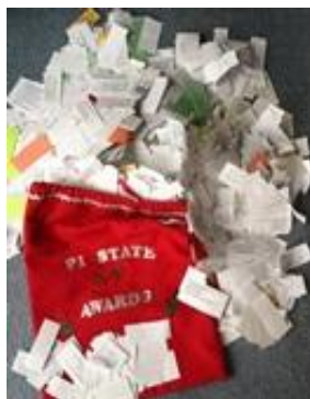
$6,775 in Pi State Scholarship Benefit Tickets