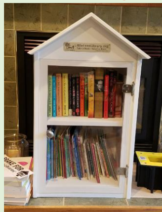
Beta Omega has constructed a “Book House” that is located outside a local food pantry in the community. It contains books for children and adults to borrow and to promote literacy.