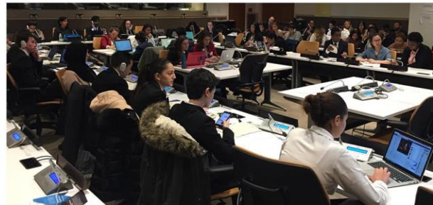
Participants in the 2017 SLCD

Students then design and implement service projects that bring their perspectives into active engagement with the community. These form the basis for their shared recommendations at the Student Leadership Conference.