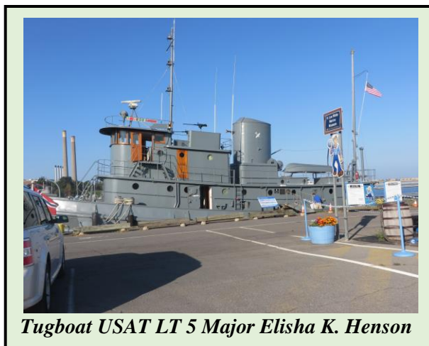
Tugboat USAT LT 5 Major Elisha K. Henson