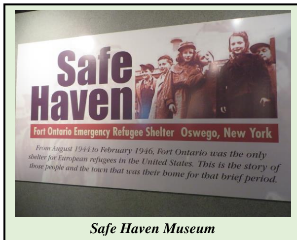
Safe Haven Museum

As well as the new State Area Council Map in vertical and horizontal formats, the following references may be found: Guidelines for Area Councils; Area Council Visitation Request Form; Area Council Visitation Guidelines; Area Council and Conference Chart; Area Councils Rotation Chart 2015-2024; Flyers and Registration Forms for Area Councils; Area Council Financial Report; and Sample Area Council Evaluation Form.