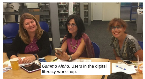
Gamma Alpha . Users in the digital literacy workshop.